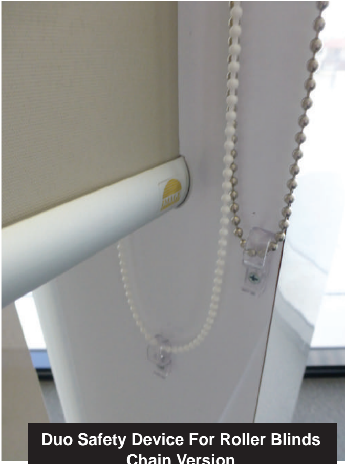
Duo Safety Device For Roller Blinds Chain Version