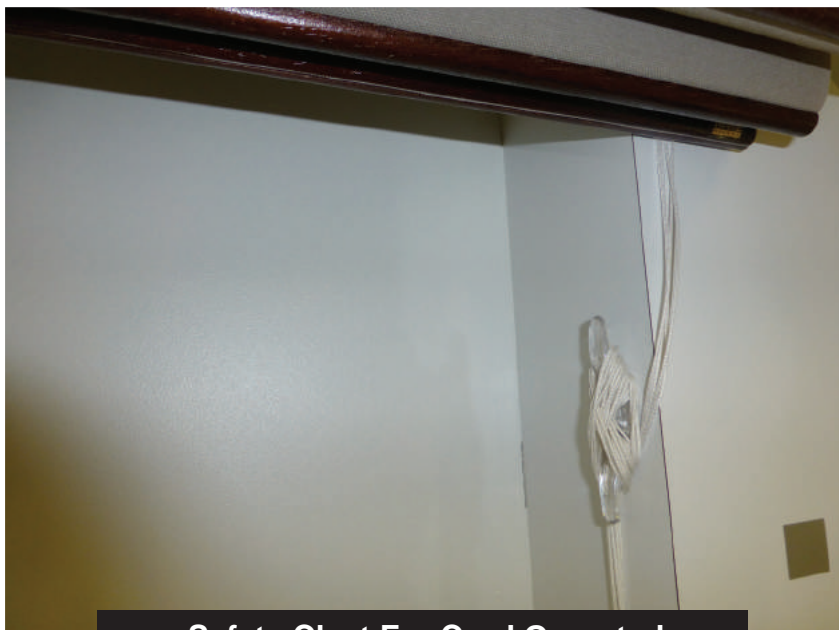
Safety Cleat For Cord Operated Roman Blinds